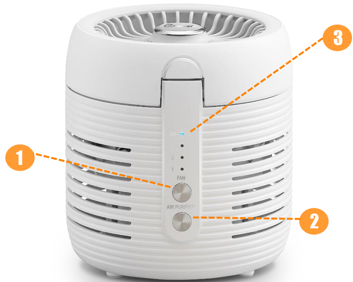
Fig. 2 (Main)