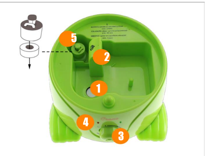
Fig. 2 (Bottom of Water Tank)