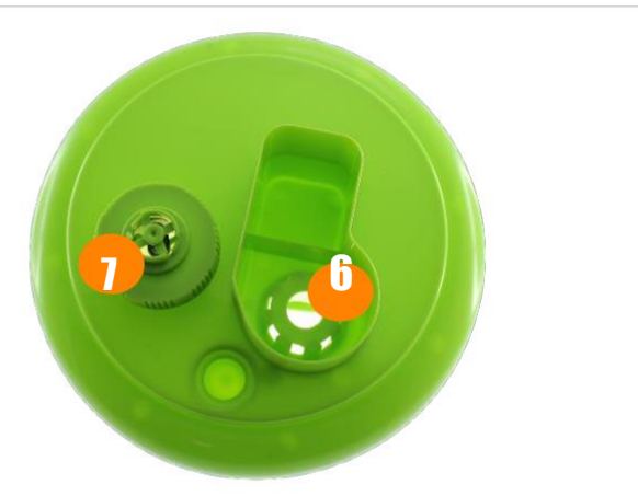
Fig. 3 (Mist Lid)

8. Mist Output Slot (Location may differ based on your model)